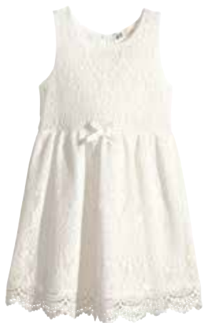
Lace Dress H&M Kids £9.99

Add the ultimate girly twist to this summer's key trends as girls' fashion pays homage to the season's catwalks, with yet more splashes of those fabulous florals, delicate, snowy white hues and just a hint of sensationally 70's inspired prints.