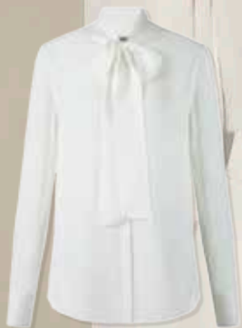
Pussy Bow Blouse Jigsaw £129