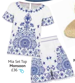
Mia Set Top Monsoon £36