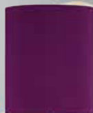
Lustre Glass Table Lamp Next £25