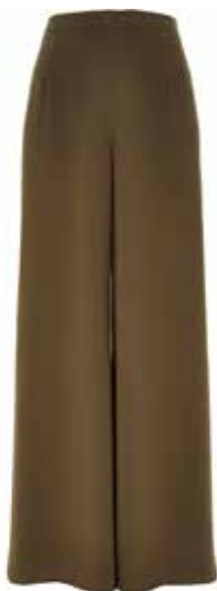
Khaki Palazzo Trousers River Island £35