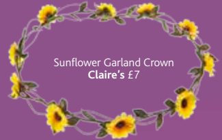
Sunflower Garland Crown Claire's £7