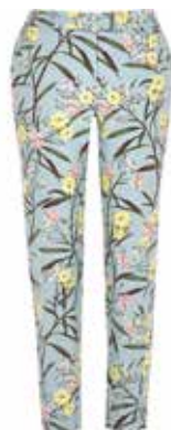
Blue Floral Print Smart Cigarette Pants River Island £42