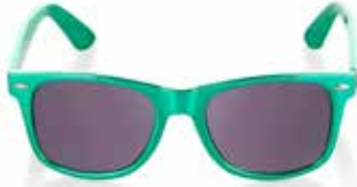
Metallic green mirror sunglasses New Look £5.99