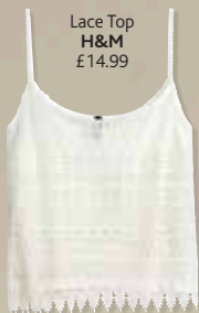
Lace Top H&M £14.99