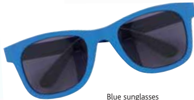
Blue sunglasses Next £6