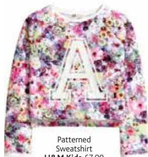
Patterned Sweatshirt H&M Kids £7.99