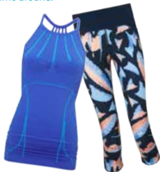
Chaturanga Yoga Vest Sweaty Betty £60