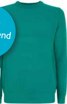
Green Summer Knitted Jumper New Look £14.99