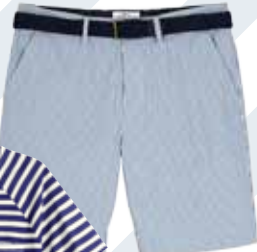
Signature Blue Ticking Stripe Chino Shorts Next £28