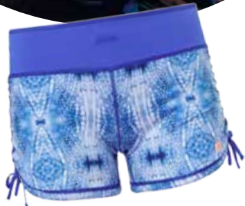
Bikram Yoga Shorts Sweaty Betty £45

TRACK YOUR RESULTS. By logging your workouts and what you have achieved in each session you'll stay motivated and determined to challenge yourself next time around.