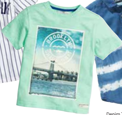
T-Shirt with a Print H&M Kids £5.99