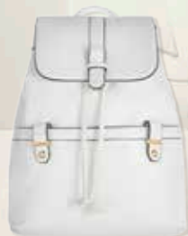
Sophie Sporty Backpack Accessorize £35