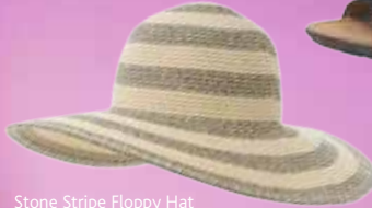
Stone Stripe Floppy Hat New Look £12.99