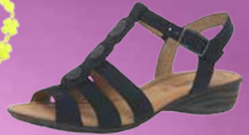
Gabor Style Eartha Johnsons Shoes £69.99