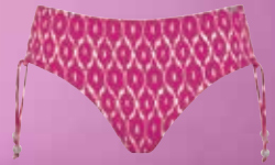
Beauty-Full Ikat Bikini Bottoms Triumph £25