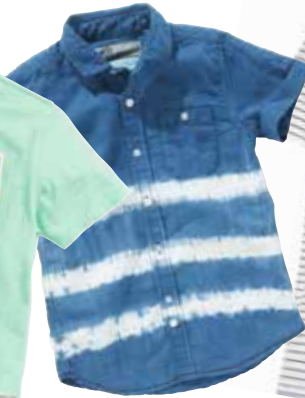
Denim Tie Dye Shirt Next £11