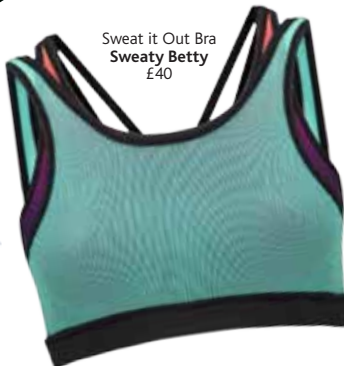
Sweat it Out Bra Sweaty Betty £40