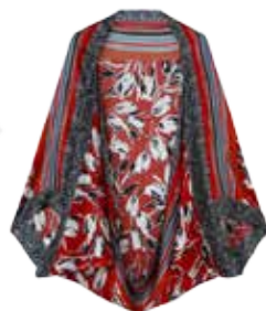
Cocoon Cape Jigsaw £89