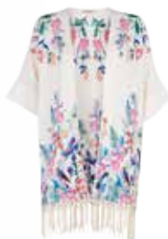
Margot Kimono Monsoon £59