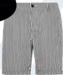
Black and White Stripe Shorts New Look £22.99