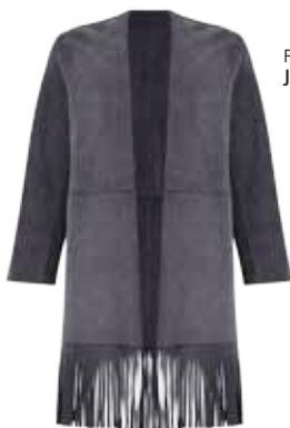
Suede Fringe Jacket Jigsaw £395