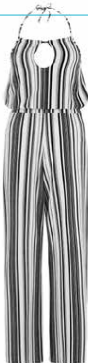
Cameo Rose Black Stripe Halter neck jumpsuit New Look £19.99