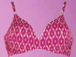
Beauty-Full Ikat Bikini Top Triumph £47