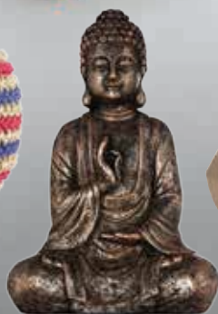
Buddha Sculpture Next £35