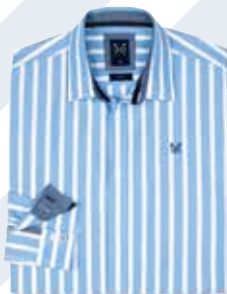
Buckland Shirt Crew Clothing £55