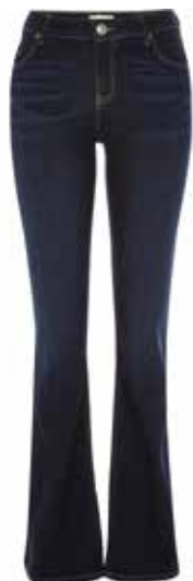
Dark Wash Brooke Flare Jeans River Island £42