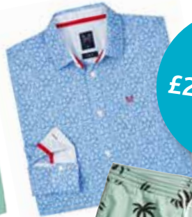
Bayswater shirt Crew Clothing £60