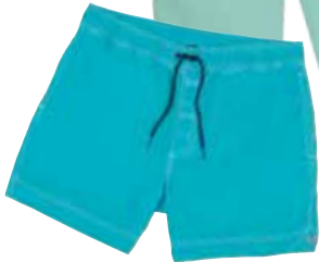
Rock Short Crew Clothing £45