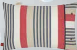
Breton Stripe Cushion Next £16