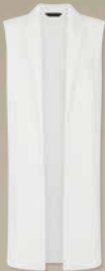
Cream Crepe Sleeveless Duster Coat New Look £19.99