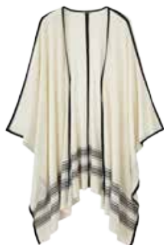
Summer Blanket Poncho Jigsaw £129

A collection of flowing fabrics, fabulously free-spirited prints, devil-may-care flairs, sumptuous suede and fashion-forward fringing bring the 70's flavour to life once more this season, while towering platforms complete this laid-back look. Modern accents work together with hippie motifs to create a subtle, yet nostalgic nod to this iconic, fashion-fabulous decade.