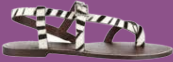
Zebra Marina Sandal Jigsaw £49