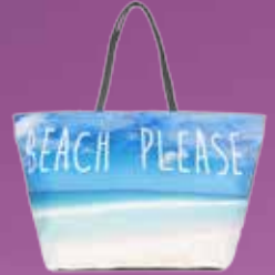
Blue Beach Please Shopper Bag New Look £15.99

Classic tote bags and statement sunglasses will always add that fabulous finishing touch to the perfect outfit; while ultra-glam floppy hats, gladiator sandals and printed beach bags will have you perfectly pool-side ready in an instant this summer.