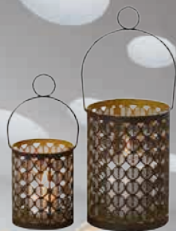
Windlight Jaro Cargo £10

Whether you're bringing the outdoors in with cool, beside-the-seaside, nautical stripes, or big and bold statement colours, our spectacular selection of homeware stores showcase a range of imaginative ways to create your own in-home summer haven.