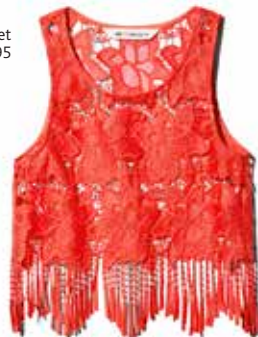
H&M Loves Coachella Short Lace Top H&M £14.99