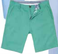
Bermuda Shorts Crew Clothing £50