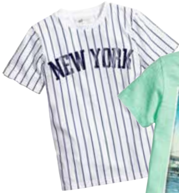
Short Sleeved Baseball Top H&M Kids £7.99