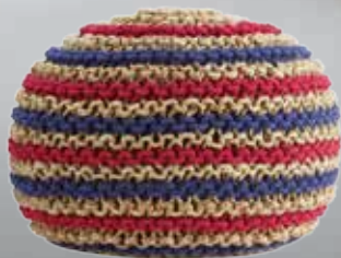
Knitted Pod Next £70