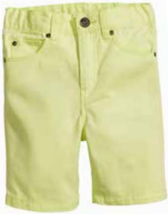
Twill Shorts H&M Kids £5.99