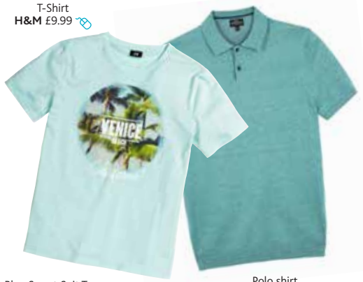
T-Shirt H&M £9.99