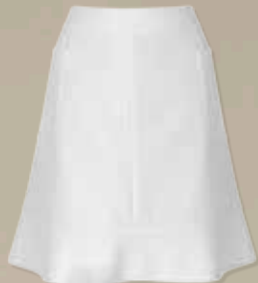
Flippy Skirt Jigsaw £98