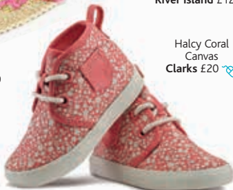
Halcy Coral Canvas Clarks £20