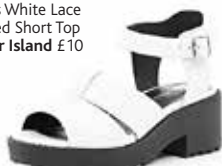
Girls White Clumpy Sandal River Island £22