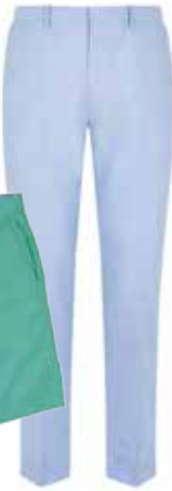
Light Blue Smart Suit Trousers New Look £19.99