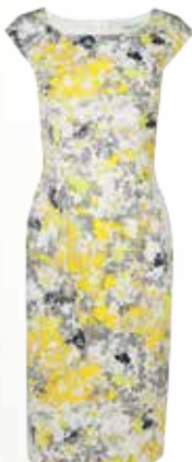
Hannah Printed Shift Dress LK Bennett £195