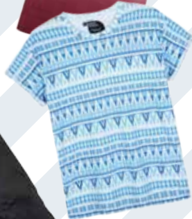
Printed T-Shirt Next £13