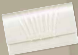
Pearl Pleat Bag Jacques Vert £69