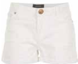
Girls White Ripped Denim Shorts River Island £12