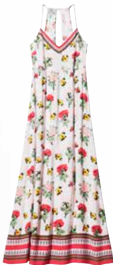
H&M Love Coachella Long Dress H&M £19.99