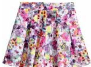
Patterned Skirt H&M Kids £7.99