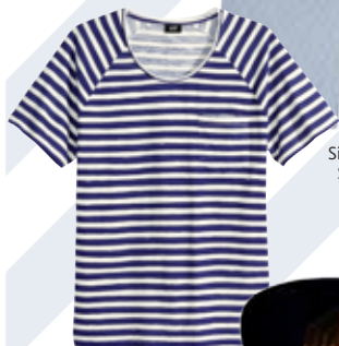
Blue and White Striped T-Shirt H&M £12.99