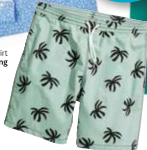
Palm print beach shorts H&M £26