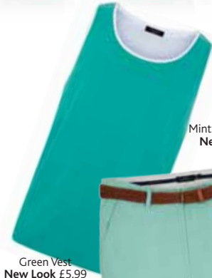
Green Vest New Look £5.99