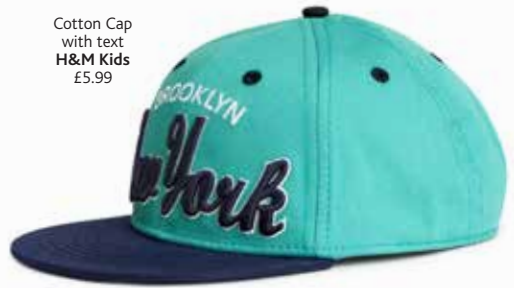
Cotton Cap with text H&M Kids £5.99

For little boys who want to be just like their Dads, why not match up their wardrobe with the men's trends and pair fresh and cool minty-hued shorts with adorable striped t-shirts, creating the perfect summertime mini me.