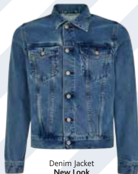
Denim Jacket New Look £24.99