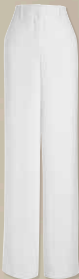
Crepe Ivory High Waist Trousers Next £35