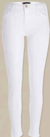
White Skinny Amelie Jeans River Island £40