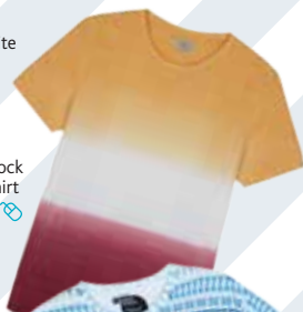
Dip Dye Block Stripe T-Shirt Next £16