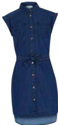
Blue denim shirt dress River Island £18