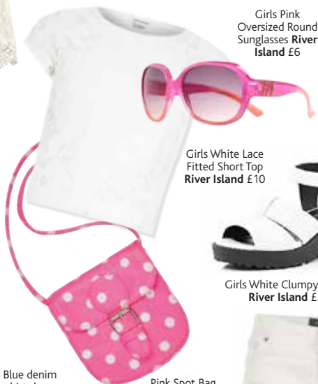
Girls Pink Oversized Round Sunglasses River Island £6