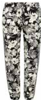
Black Floral Print Joggers New Look £17.99