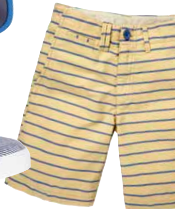
Boys yellow Oxford stripe short Baby Gap £16.95