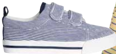
Patterned Trainer H&M Kids £7.99