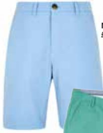
Blue/Mint Shorts New Look £19.99