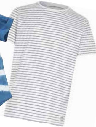
Boys Striped Short Sleeve T Shirt River Island £7.00