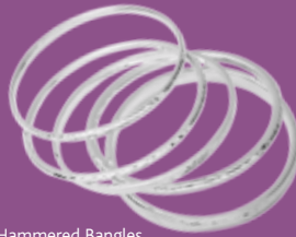
Hammered Bangles Hersey Silversmiths and Jewellers starting from £54.50